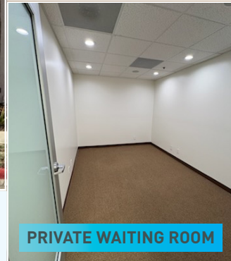
PRIVATE WAITING ROOM