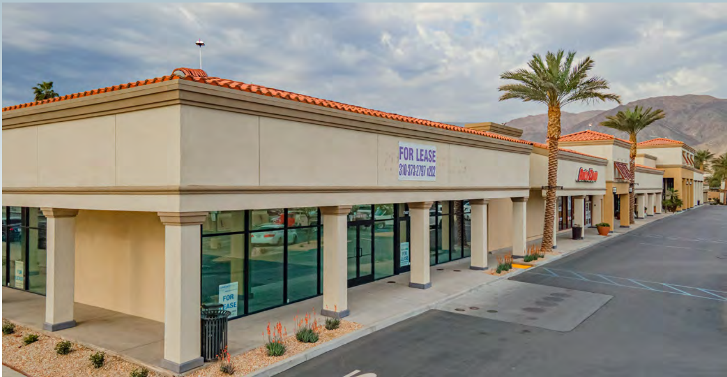
RETAIL SPACE FOR LEASE ±4,400 TOTAL SF, DIVISIBLE TO 3,003 SF END-CAP AND 1,397 SF RETAIL SPACE